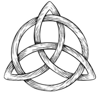
Celtic Trinity Knot