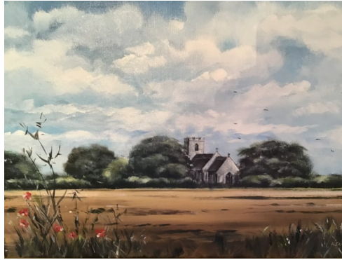
Painting of Hempstead Church by Adrian Coiley - see Lessingham & Hempstead article on page 4

In the recent beautiful weather, I have enjoyed sitting in the churchyards of some of our beautiful churches. Many of them have benches where you can take the weight off your feet. Lots of our churchyards contain a multitude of wildlife particularly regarding a wonderful diversity of plants. They are also places which are special to our villages, where generations of local families have been laid to rest.